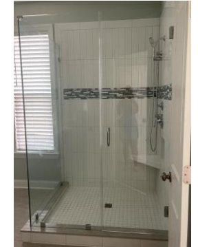
Shower Door Frameless Door