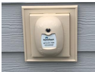
PEST CONTROL Built-in Pest Control System · Taexx®

NOTE: *This information is for reference only and subject to change without notice.