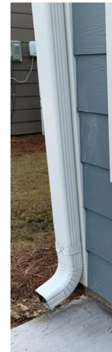
UPGRADES Gutters on front and rear of house.