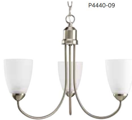
BREAKFAST FIXTURE Brushed Nickel