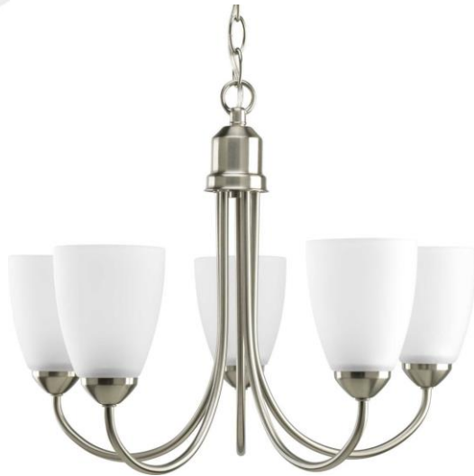
DINING FIXTURE Brushed Nickel