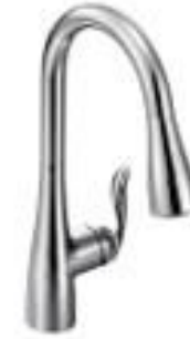
KITCHEN FAUCET Moen Arbor - BN