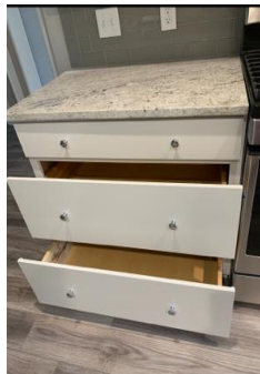
Cabinet Option Pot and Pan Drawer