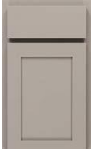
KITCHEN LOWER CABINETS & ISLAND Aristrokrift Ellis Stone Gray