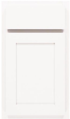
KITCHEN UPPER CABINET Aristrokrift Ellis White

Showcase Home Oaksid Address: 149 Citrea Drive Lot: 6.2039