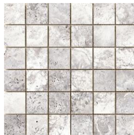
SHOWER FLOOR 2x2 Cabo Shore Mosaic