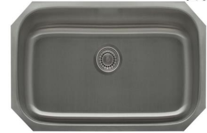
SINK Single Bowl Undermount