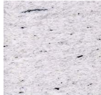
QUARTZ COUNTERTOP Pitaya White Granite