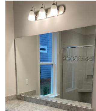
Mirror Plate Glass