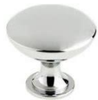
CABINET HARDWARE Included Chrome