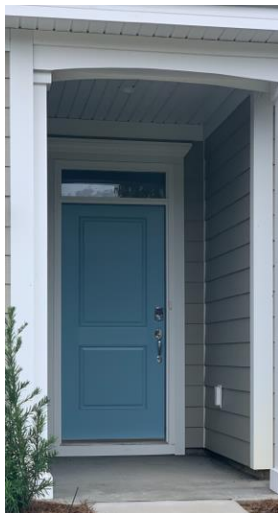
FRONT DOOR Included Front Door -

Showcase Home Oakside Address: 149 Citrea Drive Lot: 6.2039