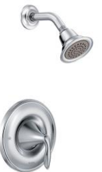
SHOWER FAUCET Moen Eva Chrome