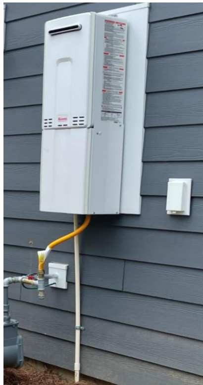
WATER HEATER Rinnai Tankless Water Heater Exterior location temp control