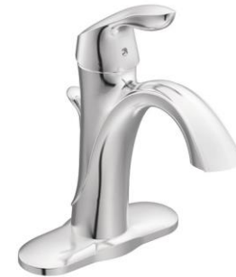
FAUCET Moen Eva Chrome