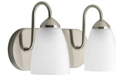
SECONDARY BATH FIXTURE Brushed Nickel