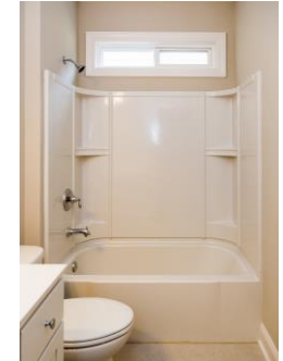
Included Fiberglass Tub