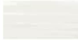
SHOWER WALL TILE Silhouette Contour 12x24 Stacked/Vertical