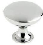
CABINET HARDWARE Included Chrome