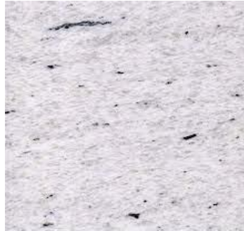
COUNTERTOP Pitaya White Granite