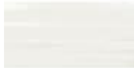
FLOOR TILE Silhouette Contour 12x24 Straight Lay