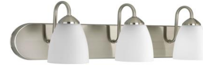
OWNER'S BATH FIXTURE Brushed Nickel