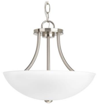
FOYER FIXTURE Brushed Nickel

Showcase Home Oakside Address: 149 Citrea Drive Lot: 6.2039