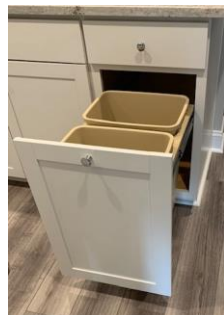
Cabinet Option Trash Roll-Out