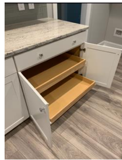
Cabinet Option Roll-Out Shelves