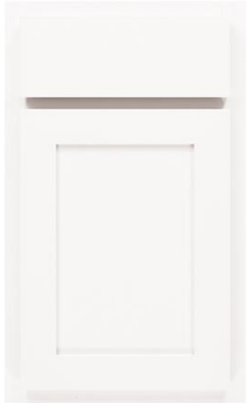
CABINET Ellis White

Showcase Home Oakside Address: 149 Citrea Drive Lot: 6.2039