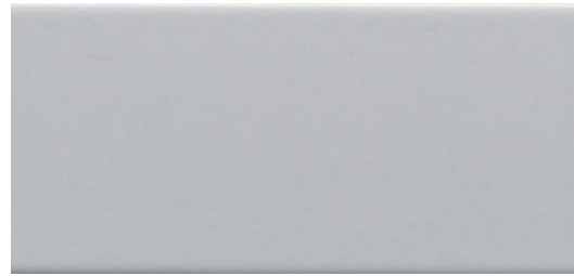
BACKSPLASH Catch Gray Matte 3x12 Subway Tile