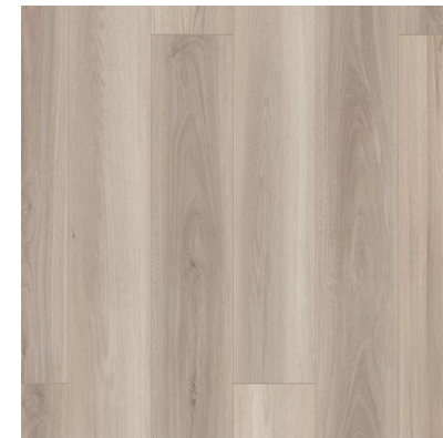
EVP FLOORING Polaris Plus 5091 Lighthouse