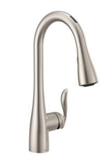
SINK STAINLESS STEEL