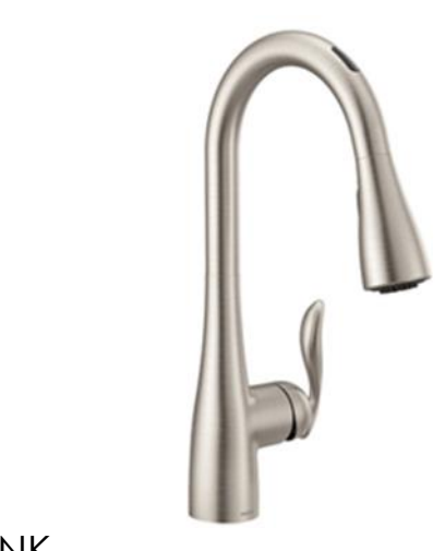
SINK STAINLESS STEEL