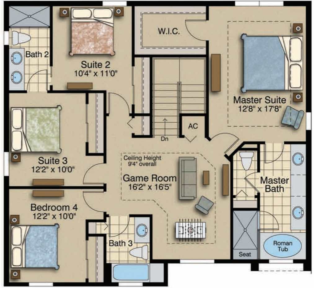
The BARCELONA 4 Bedroom, 3½ Bathrooms & 2 Car Garage

2795 Sq. Ft. Living Area 452 Sq. Ft. Garage 233 Sq. Ft. Covered Lanai 69 Sq. Ft. Covered Entry