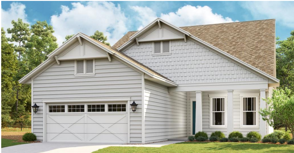
Artist Rendering of Lila Model, Elevation BH- Hardie