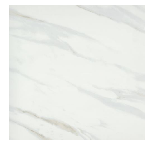
24x24 Floor Tile