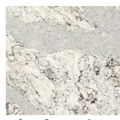
Quartz Countertop 3cm