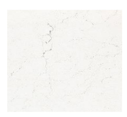
Quartz Countertop 3cm