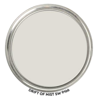
Interior Wall Color