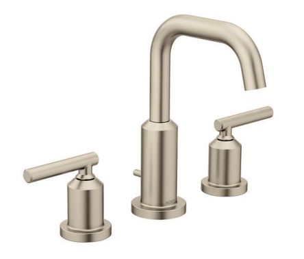
Moen Widespread Faucet Chrome