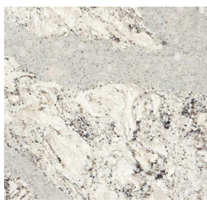
Quartz Countertop 3cm