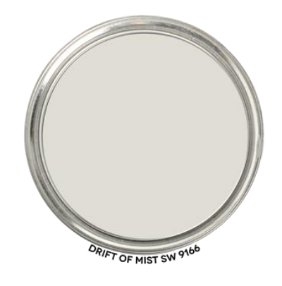
Interior Wall Color