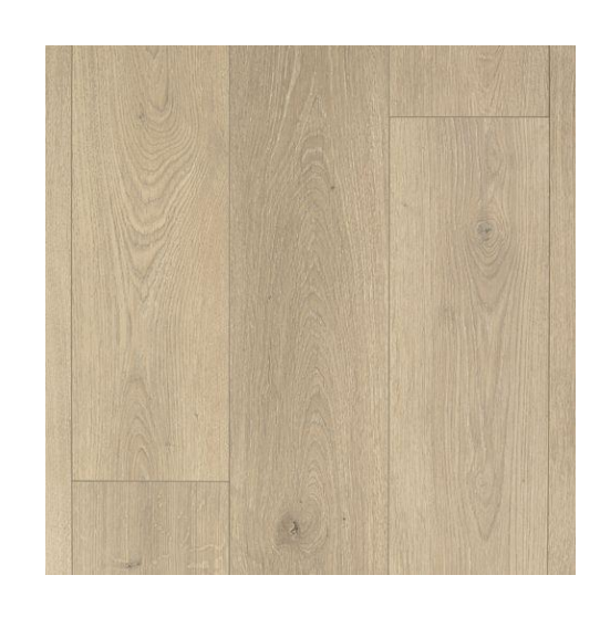
Laminate Wood Flooring Throughout Main Living, Den, and Master Suite