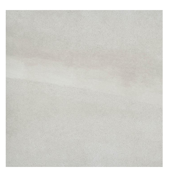
MAIN FLOOR 32X32

**The images shown are conceptual in nature and the perception of color, texture, and pattern may be different when viewed in person. Options subject to change without notice. **