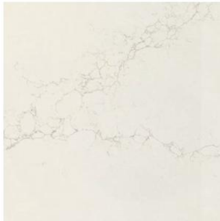
Liberty Gold – QTZ L3