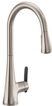
FAUCET Sinema – Stainless Handle