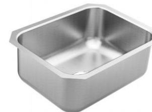
SINK Stainless Steele