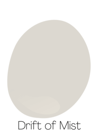
Interior Wall Color