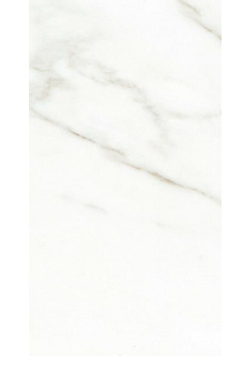
Shower Wall Tile