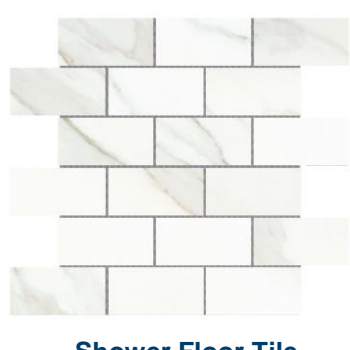
Shower Floor Tile