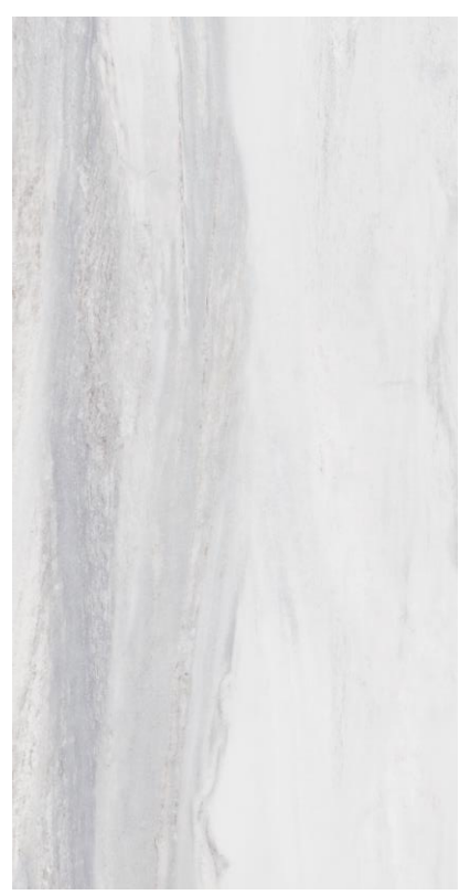
12x24 Shower Wall Tile