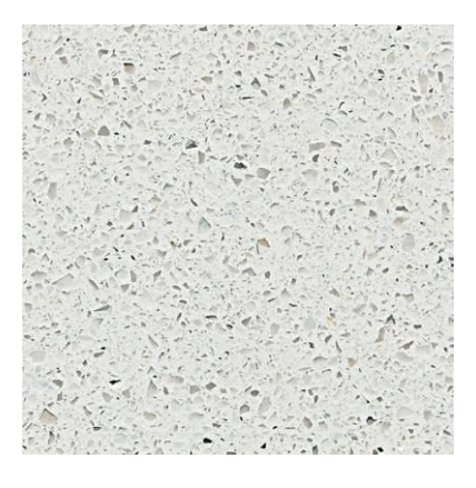
White Quartz 3cm