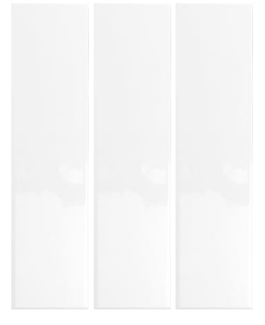
Bath 2 Tub Tile 4x16 White