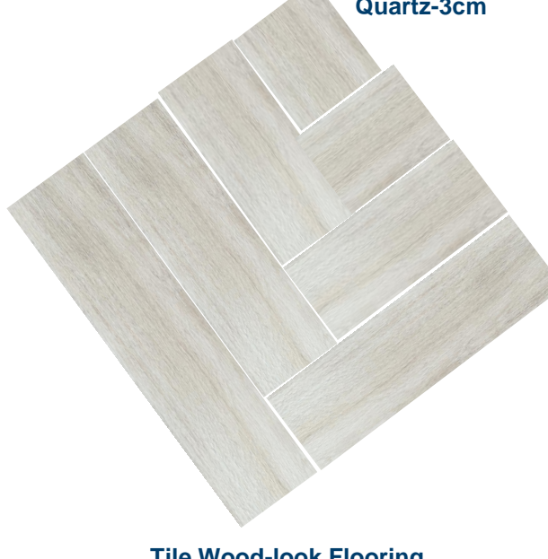
Tile Wood-look Flooring Herringbone Installation