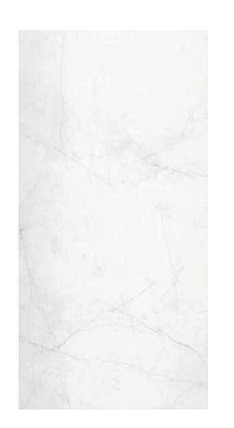
Sterlina – White Polished 12x24 Shower Wall Tile