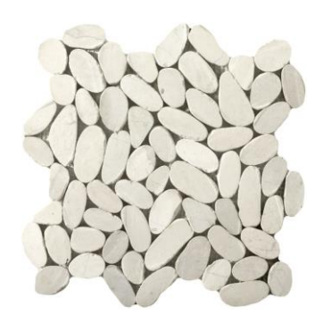
Pebble Shower Floor Tile