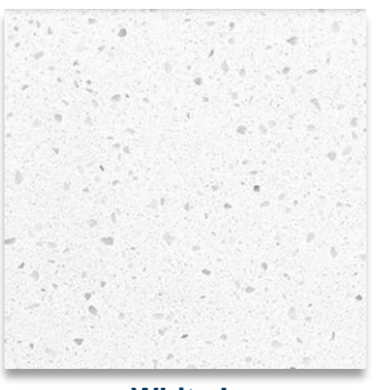
White Ice Quartz-3cm