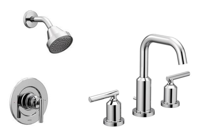
Moen Gibson Collection Chrome