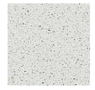
White Quartz 3cm