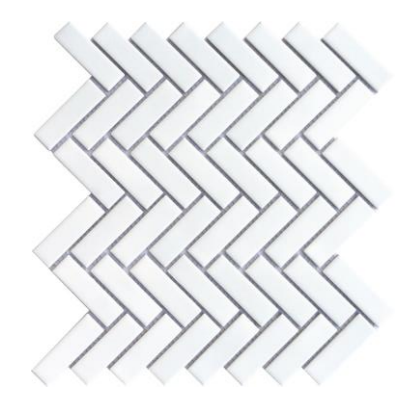
Bath 3 Shower Floor