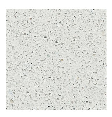
White Quartz 3cm