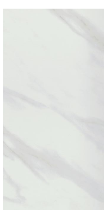
12x24 Shower Wall Tile