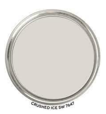
Interior Wall Color