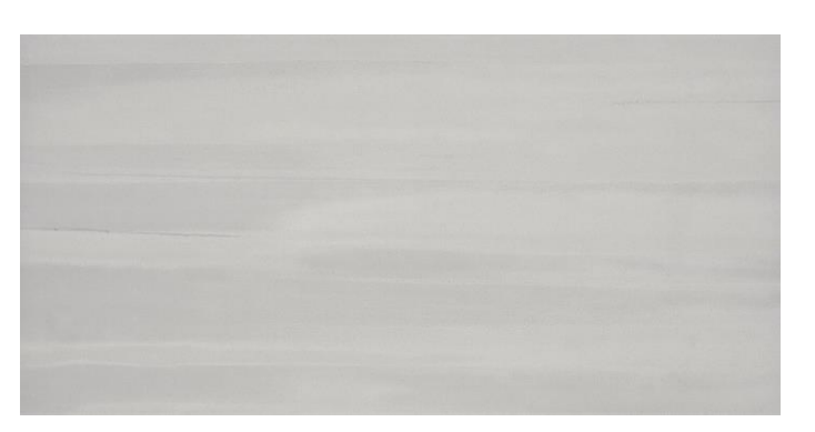
12x24 Floor Tile