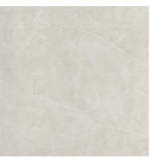
24x24 Tile Flooring