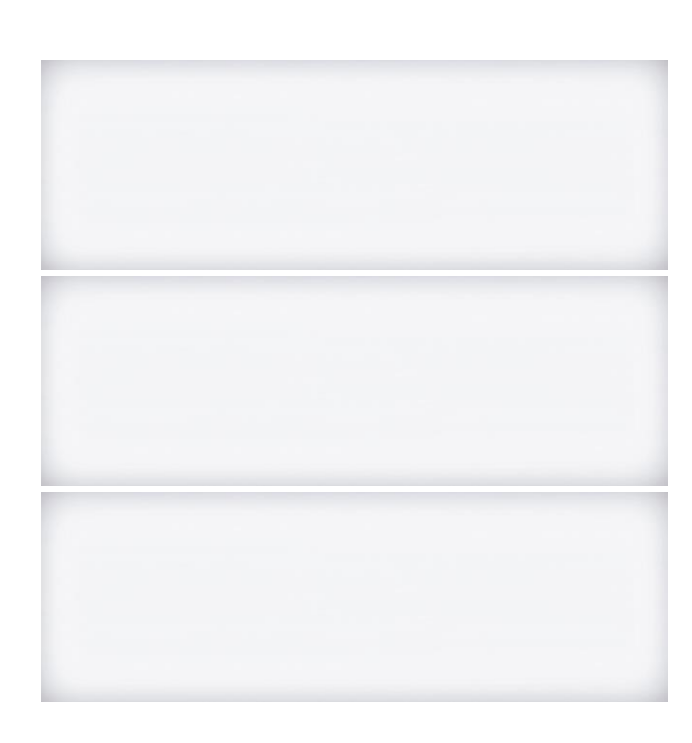
Bath 2 Tub Tile 10x30 White