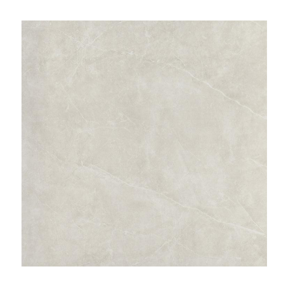
24x24 Floor Tile