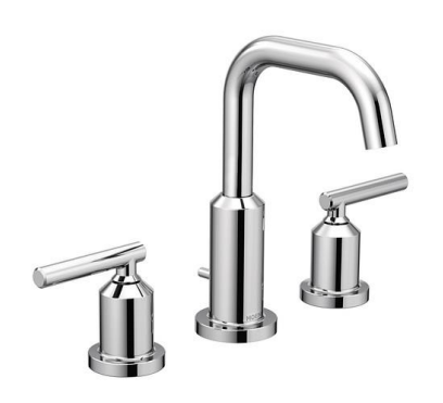
Moen Widespread Faucet Chrome