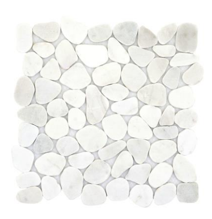
Shower Floor Tile