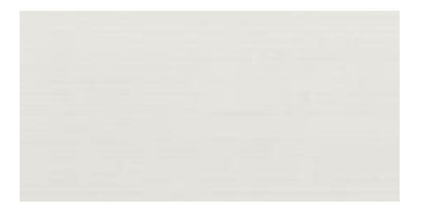
Bath Floor Tile