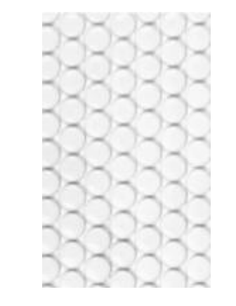
Shower Floor Tile