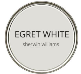
Interior Wall Color