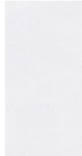
12x24 Shower Wall Tile