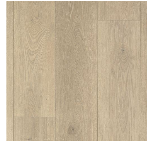
Laminate Wood Plank Flooring for Den & Bedrooms