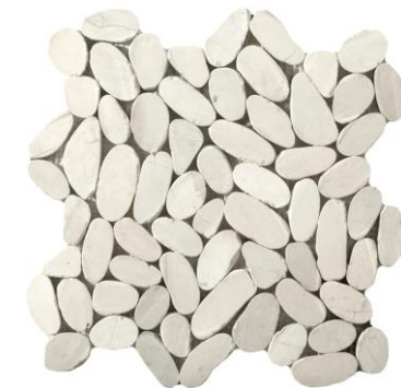
Shower Floor Tile