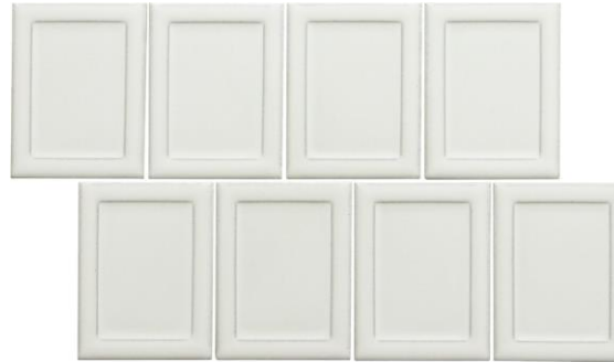
3x4 White Artisan Backsplash Tile