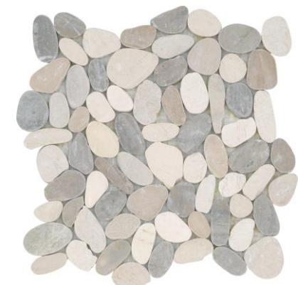
Shower Floor Tile