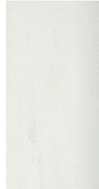
12x24 Shower Wall Tile