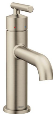
Moen Widespread Faucet Brushed Nickel