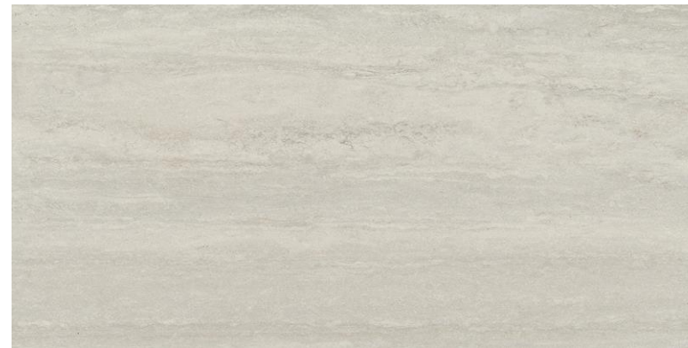
12x24 Floor Tile