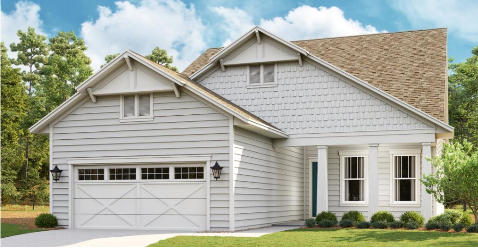
Artist Rendering of Lila Model, Elevation BH- Hardie