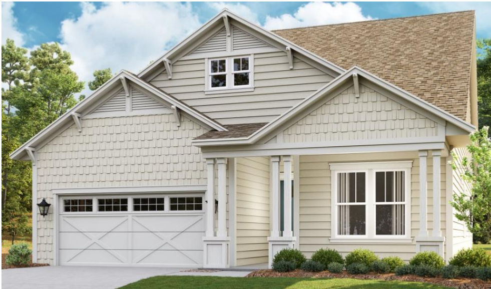
Artist Rendering of Madison Model, Elevation BH Craftsman