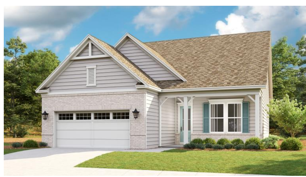
Artist Rendering of Emily Model, Exterior AB Heritage Brick