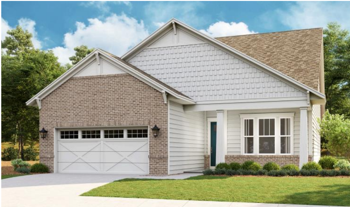
ELEVATION: BB- Craftsman