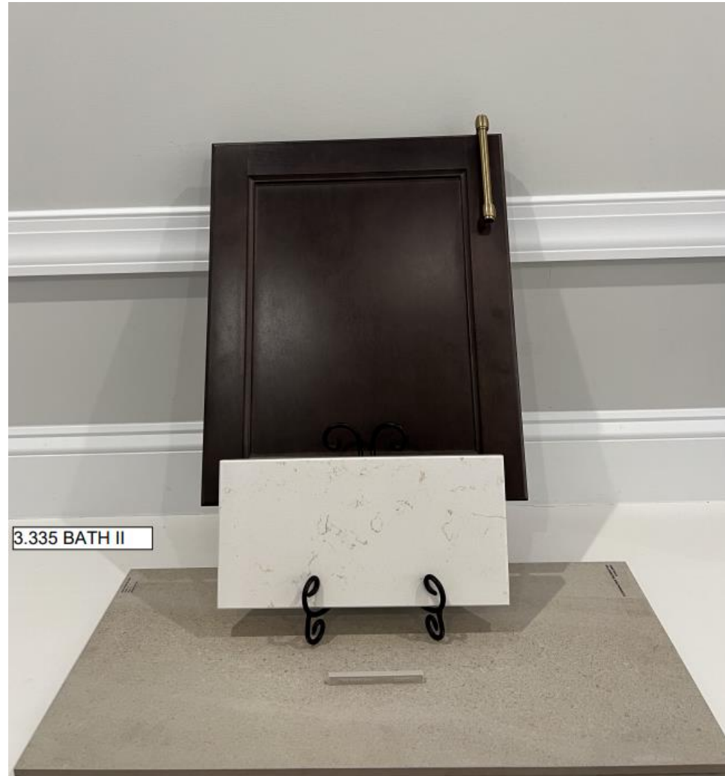
3.335 BATH II