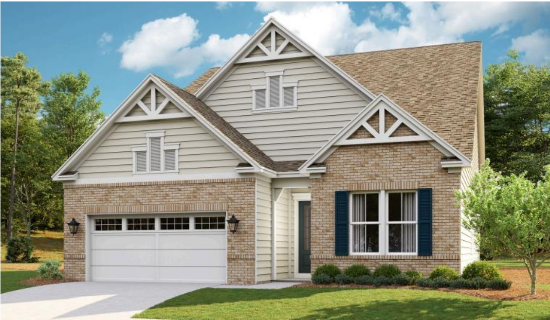
Artist Rendering of Madison Model, Elevation AB- Heritage Brick