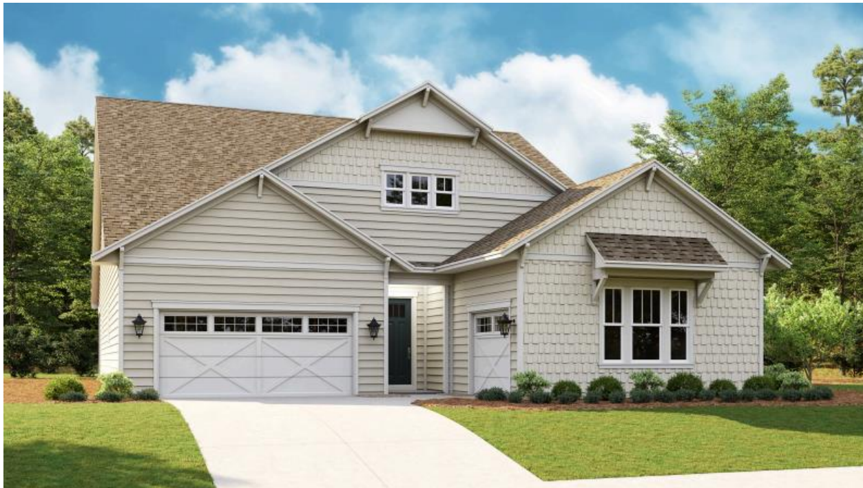
Artist Rendering of Sydney Model, Elevation BH- Craftsman ELEVATION: BH