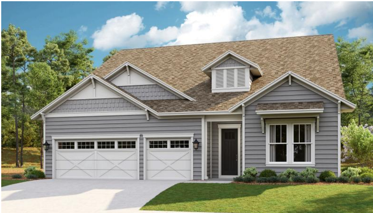
Artist Rendering of Paige Model, Elevation BH- Craftsman