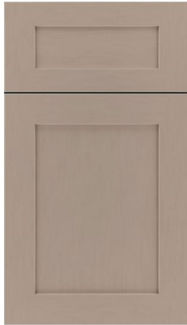
BATHROOM CABINETS – KITCHENCRAFT YURO PORTOBELLO (FLOATING CABINET)