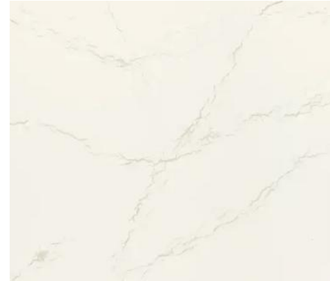
COUNTERTOP – CAMBRIA QUARTZ INVERNESS FROST