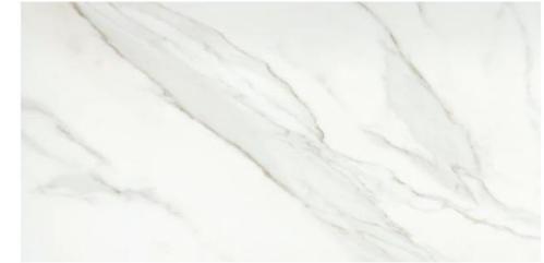
SHOWER WALL– EMSER TILE NOBLEZA LUGO PL 12X24