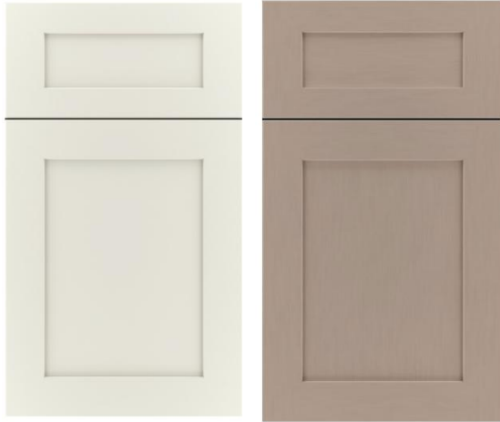
KITCHEN CABINETS – KITCHENCRAFT YURO PERIMETER: NORDIC ISLAND: PORTOBELLO