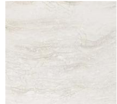
ISLAND COUNTERTOP– CAMBRIA QUARTZ IRONSBRIDGE