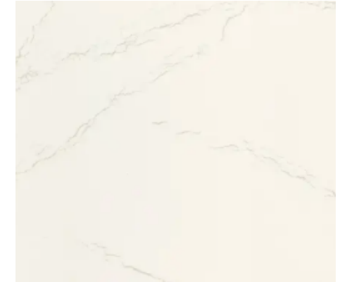
PERIMETER COUNTERTOP & FULL HEIGHT BACKSPLASH – CAMBRIA QUARTZ INVERNESS FROST