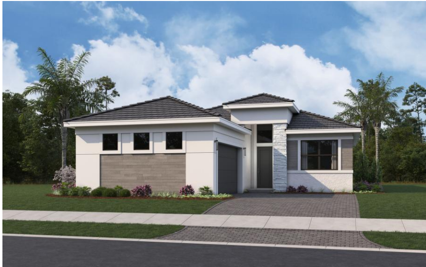
ELEVATION: A - Tropical Modern