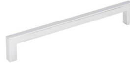
HARDWARE – 625-160-PC