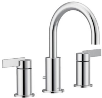
BATHROOM FAUCET – CIA 8” CH