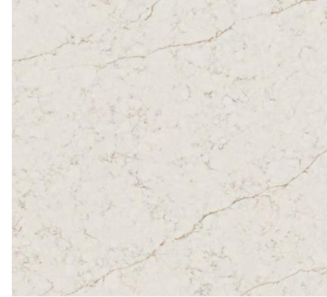
COUNTERTOP – DAL TILE FREEDOM CALACATTA