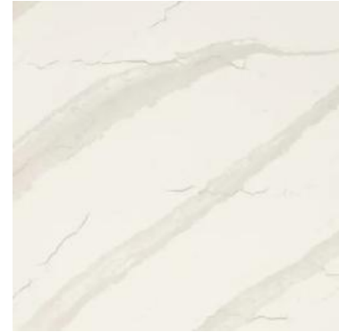
COUNTERTOP – CAMBRIA INVERNESS SWANSEA