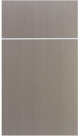
BATHROOM CABINETS – KITCHENCRAFT SUMMIT WIRED MERCURY (FLOATING CABINET)