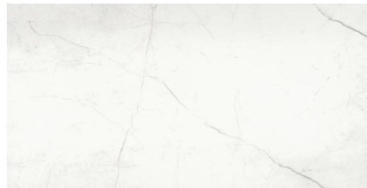
FLOORING– EMSER TILE STERLINA II WHITE PL 12X24