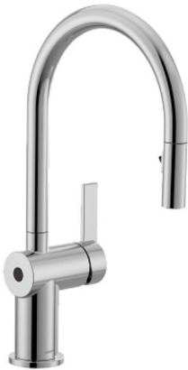
KITCHEN FAUCET – MOEN CIA W/ MOTION SENSE CHROME