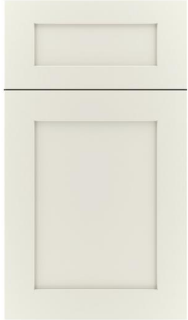
BATHROOM CABINETS – KITCHENCRAFT SALEM NORDIC