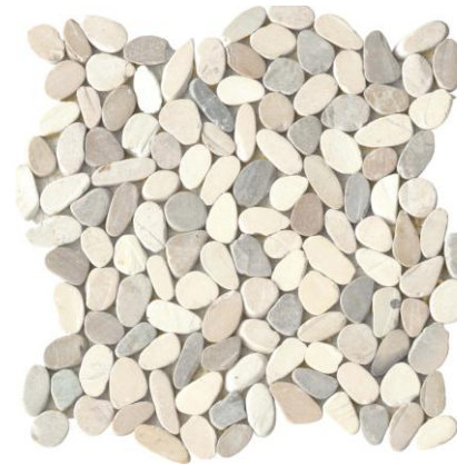
SHOWER FLOOR – EMSER TILE OPUSCAR PEBBLE LIGHT MO