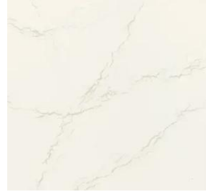
COUNTERTOP – CAMBRIA INVERNESS FROST