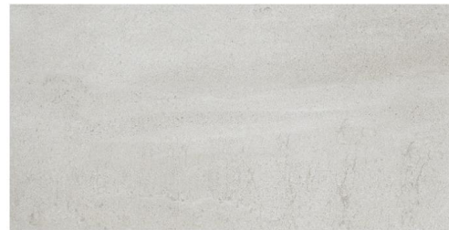
TUB WALL– EMSER TILE PORTO II WHITE PL 12X24