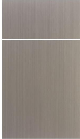
BATHROOM CABINETS – KITCHENCRAFT SUMMIT ACRYLIC WIRED MERCURY