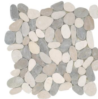
SHOWER FLOOR – EMSER TILE VENETIAN PEBBLE MEDICI