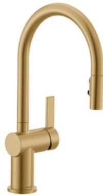
KITCHEN FAUCET – MOEN CIA BG