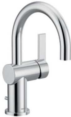
BATHROOM FAUCET – CIA SL CH