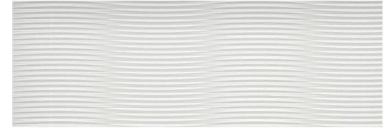
SHOWER WALL – EMSER TILE NUOVO PRINCESS WHITE