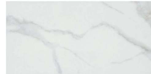
FLOORING– EMSER TILE TIMES SERENDRA LUNA MT 12X24