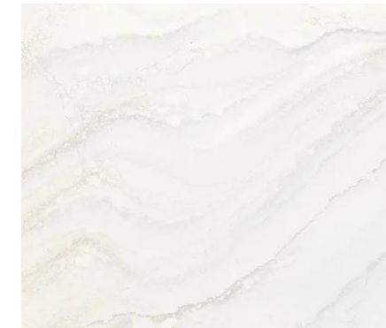
ISLAND COUNTERTOP– CAMBRIA QUARTZ EVERLEIGH