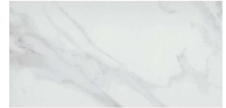
SHOWER WALL– EMSER TILE SERENDRA LUNA PL12X24