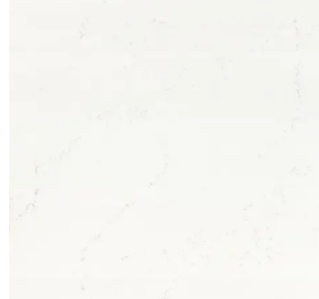
COUNTERTOP – CAMBRIA QUARTZ SMITHFIELD