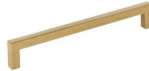
HARDWARE – 625-160-SBZ