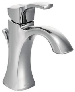
BATHROOM FAUCET – VOSS SL CH