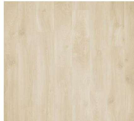
FLOORING – MOHAWK REVWOOD CYPRESSFIELD PUMICE OAK