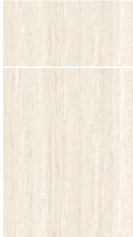
BATHROOM CABINETS – KITCHENCRAFT CONTEMPRA VERTICAL DRIFTWOOD (FLOATING CABINET)