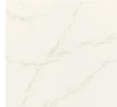
COUNTERTOP – CAMBRIA INVERNESS FROST