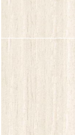
BATHROOM CABINETS – KITCHENCRAFT CONTEMPRA VERTICAL DRIFTWOOD