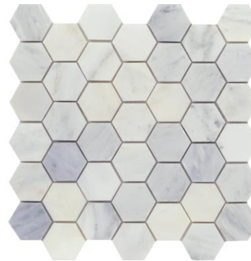
SHOWER FLOOR – EMSER TILE WINTER FROST 2" HEX