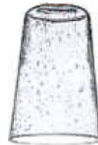
Globes For bathroom lighting Fixtures