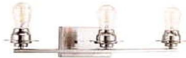
Master bath Lighting w/Globes