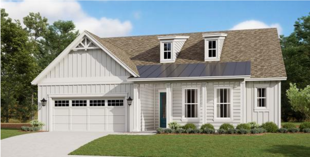
ELEVATION: BS- Right