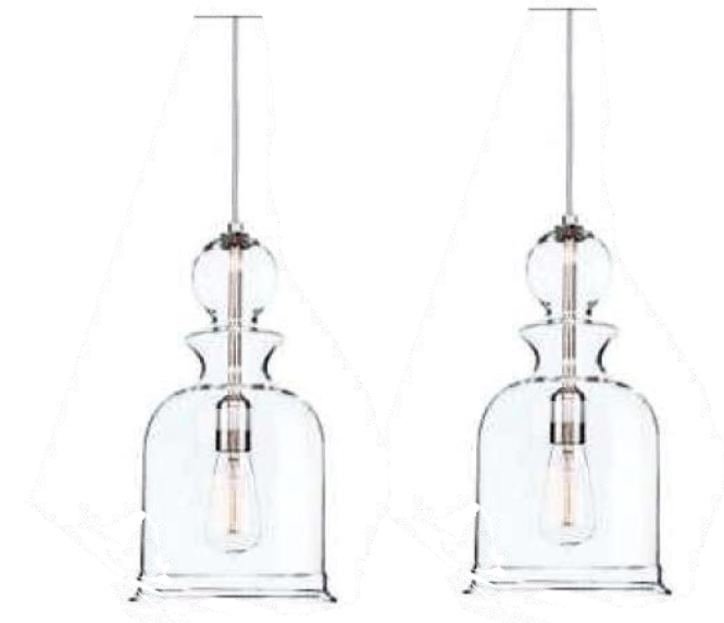
Kitchen Island Pendants