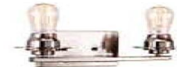
Guest bath Lighting w/Globes