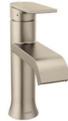
Moen Single Lever Faucet Brushed Nickel