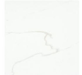
13x13 Wall Tile