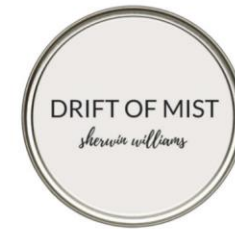
Interior Wall Color