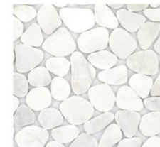
2" Hex Shower Floor Tile, Matte Finish