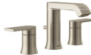
Moen Widespread Faucet Brushed Nickel