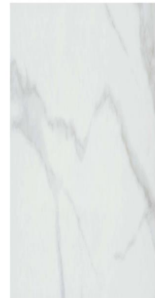
12x24 Shower Wall Tile, Polished Finish