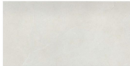
12x24" Porcelain Tile, Matte Finish