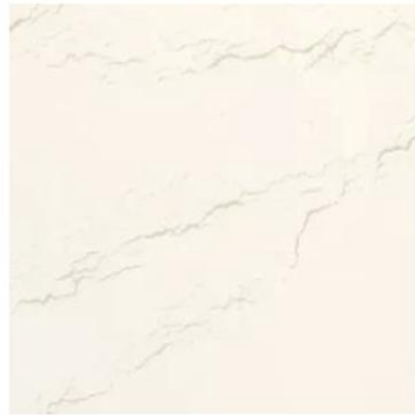
Inverness Frost © – QTZ L3