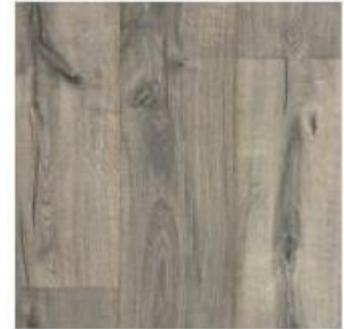
Lunar Oak | 03