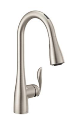
SINK STAINLESS STEEL