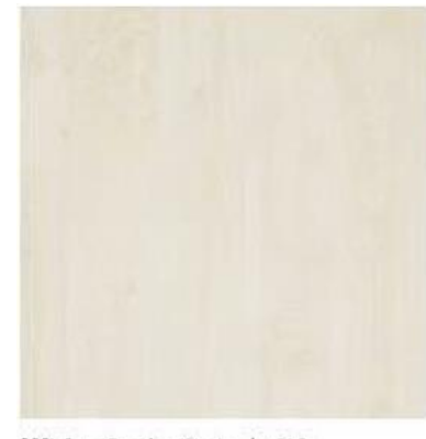
White Satin Oak | 04