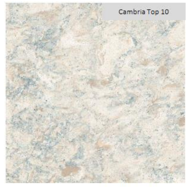
Montgomery © - QTZ L2