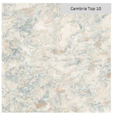
Montgomery © - QTZ L2