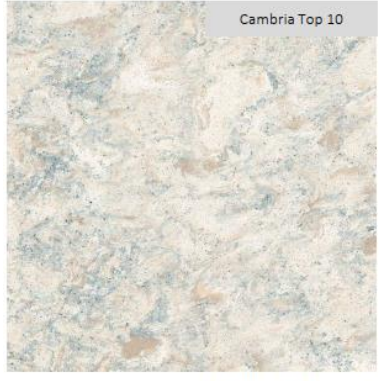
Montgomery © - QTZ L2