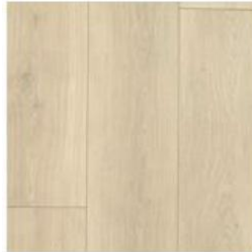
Bleached Linen | 07W